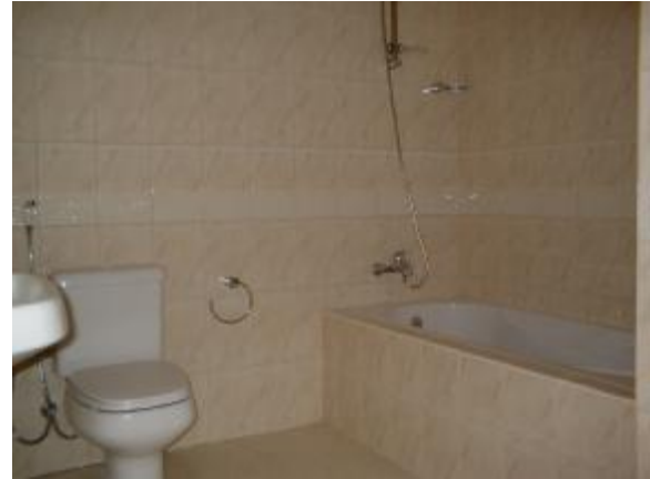
Fully Fitted Kitchen and Bathrooms