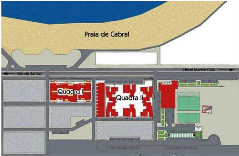
Vila Cabral I is located on Quadra I plot - frontline to Cabral Beach